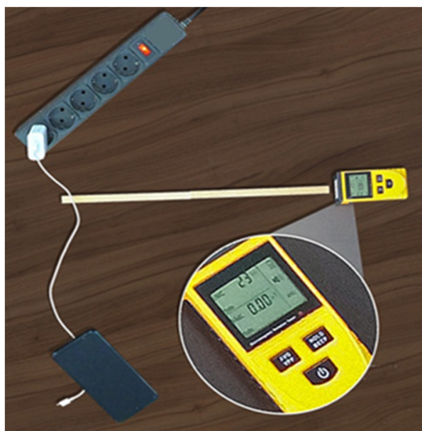
Fig. 2. Induction of EF (23 V/m) at \sim 0.5 m from cord plugged into a network adapter ( \sim 220 V)

An example of parasitic EF (23 V/m) induced by a cord plugged into the network adapter ( \sim 220 V) at \sim 0.5 m (wooden ruler) close to IF EF MPL for WP PC (Table 1) is shown in Fig. 2. However, the EMF MPL value is currently measured at 0.1 m from the device (SMPS for WP PC of \leq 25 V/m), according to SanPiN 2.1.2.1002-003 26 , paragraph 6.4.3.1.